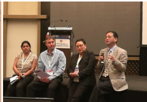
FOP WORKSHOP Q&A SESSION